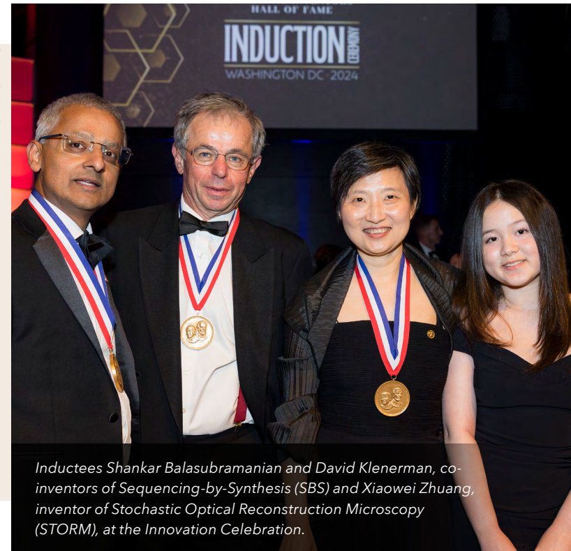
Inductees Shankar Balasubramanian and David Klenerman, co-inventors of Sequencing-by-Synthesis (SBS) and Xiaowei Zhuang, inventor of Stochastic Optical Reconstruction Microscopy (STORM), at the Innovation Celebration.