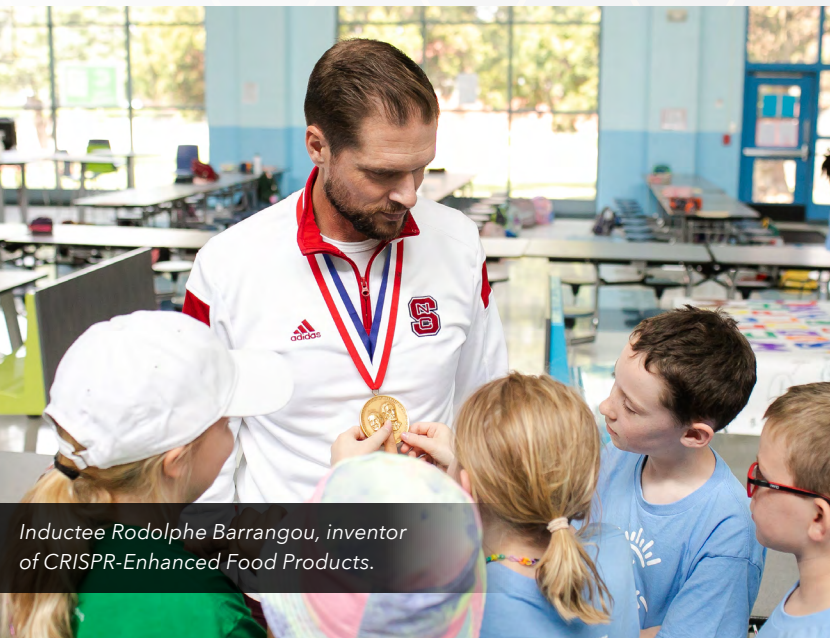
Inductee Rodolphe Barrangou, inventor of CRISPR-Enhanced Food Products.